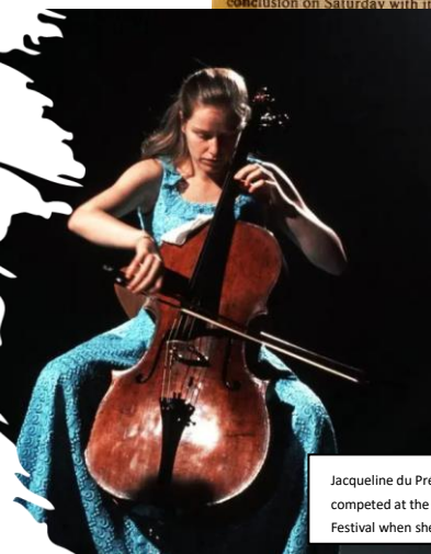
Jacqueline du Pré, the world famous cellist, competed at the Coulsdon and Purley Festival when she was 7 years old.