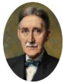
Sir George Dyson 1944-1952